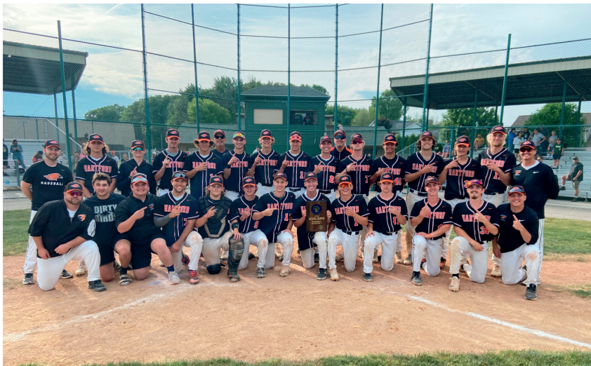
Boys Baseball Sectional CHAMPS