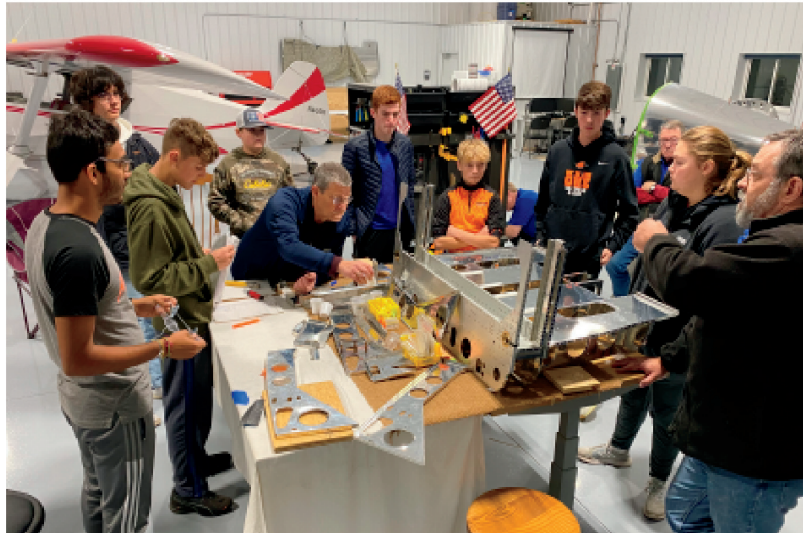
Students in the Aviation Club building their second aircraft